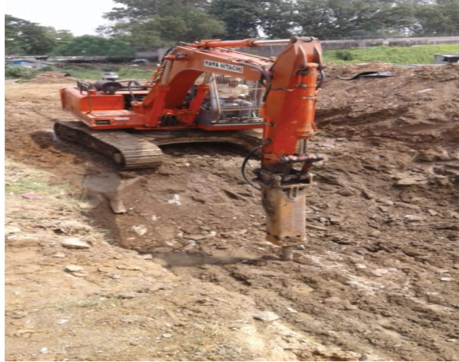
Figure 1: Rock cutting by breaker in progress at P4 site

only (Fig.1). Core recovery and RQD at this place were observed to be in the range of 8-10% and zero respectively (Fig. 2).